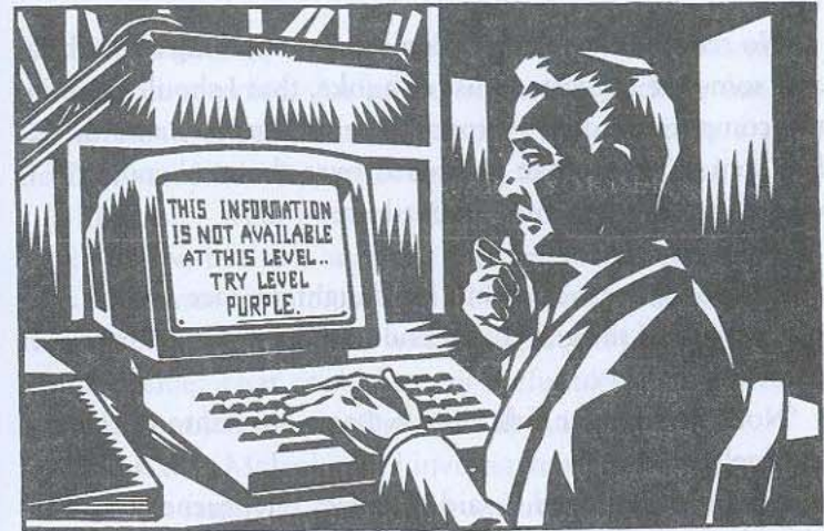
Level Purple was too high, too secret for me.