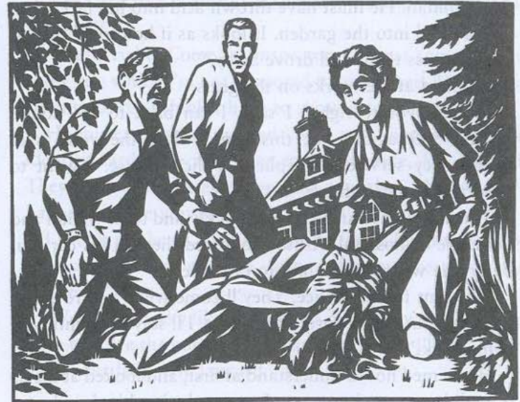
Ashton A faint voice murmured, 'My eyes! Oh my eyes!'

'Ring for an ambulance. Tell them it's an acid burn.'