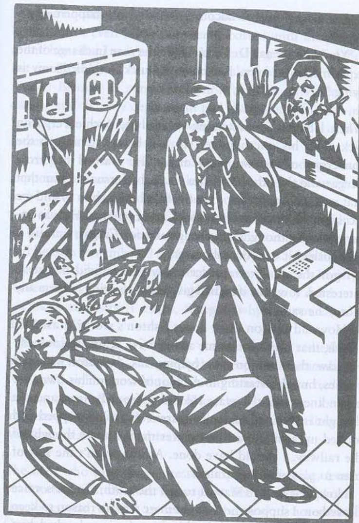
'This is an emergency. Cregar's laboratory has gone wrong.'

I went on. 'The suspected cases are Cregar and myself.'