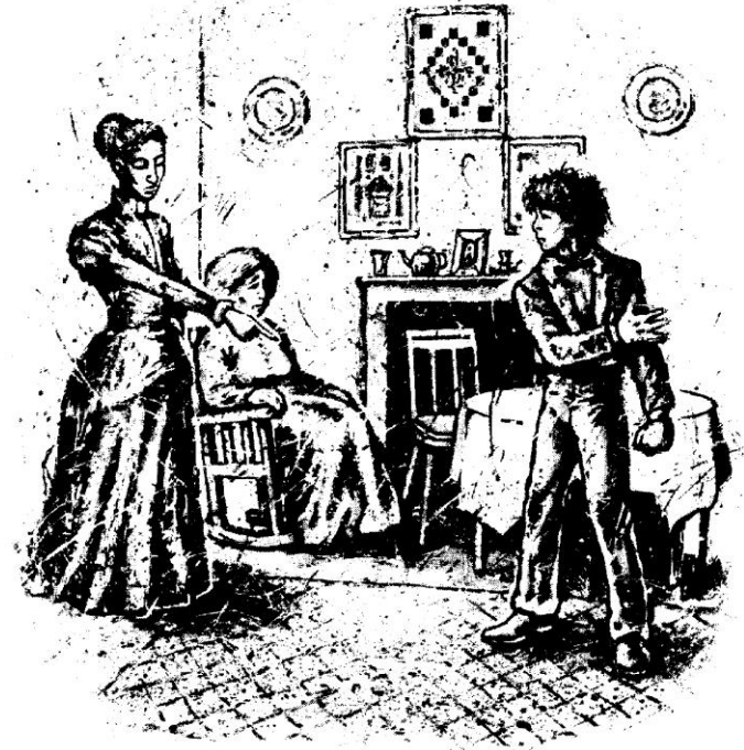
Miss Watson was angry, but the widow just looked unhappy.

Time went on and winter came. I went to school most of the time and I was learning to read and write a little. It wasn't too bad, and the widow was pleased with me. Miss Watson had a slave, an old man called Jim, and he and I were good friends. I often sat talking to Jim, but I still didn't like living in a house and sleeping in a bed.