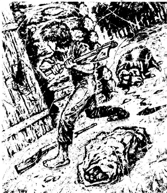
I broke down the door with an axe.

went into the woods. There I shot a wild pig and took it back to the hut with me. Next, I broke down the door with an axe. I carried the pig into the hut and put some of its blood on the ground. Then I put some big stones in a sack and pulled it along behind me to the river. Last of all, I put some