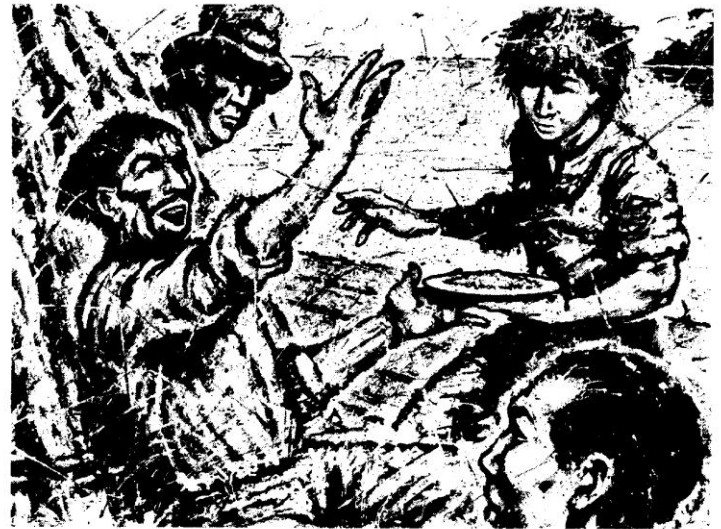
'Bring me my dinner!' said the Duke.

So we did things for him, and he liked it. But the old man