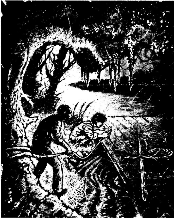
We tied the raft up under the trees.

and was about four metres by five metres. 'This could be useful,' I said to Jim, so we pulled it back to the island behind the canoe, and tied it up under the trees.