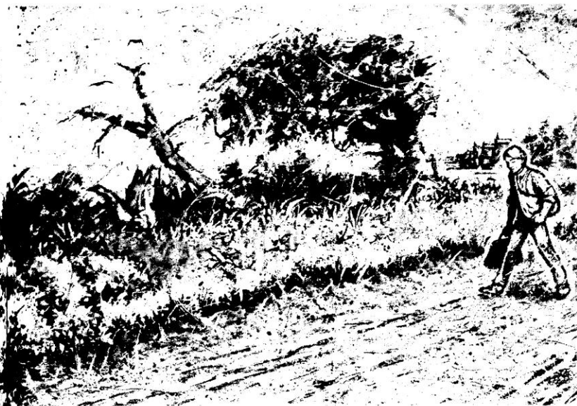
Before I was halfway to town, there was Tom Sawyer coming along.

'All right,' I said, 'but there's another thing. You know old Miss Watson's slave Jim, who ran away? Well, he's a prisoner here, and I'm going to help him escape.'