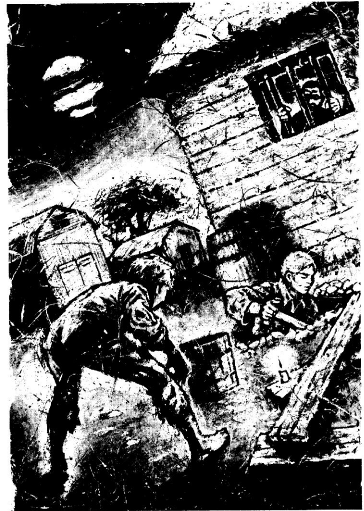
We dug a hole right under the wall of the hut.

We also wrote secret letters to everybody. Tom said that