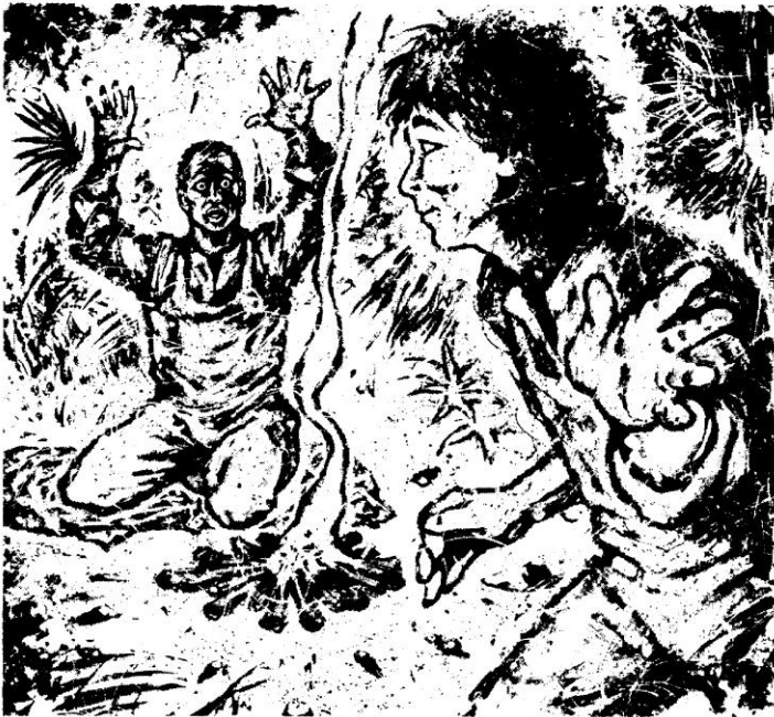
Jim fell to his knees. 'Please don't hurt me!' he cried.

Jim fell to his knees. 'Please don't hurt me!' he cried. 'I've always been good to dead people!'