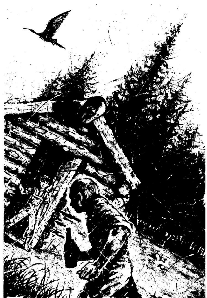
I had to stay with him in a hut in the woods.

The next day he was drunk, and he went to Judge Thatcher to get my money. The judge wouldn't give it to him. But Pop didn't stop trying and every few days I got two or three dollars from the judge to stop Pop from hitting me. But when Pop had money, he got drunk again and made trouble in town. He was always coming to the widow's house, and she got angry and told him to stay away. Then Pop got really angry and one day he caught me and took me a long way up the river in a boat. I had to stay with him in a hut in the woods and I couldn't go out by myself. He watched me all the time. The widow sent a man to find me and bring me home, but Pop went after him with a gun, and the man ran away.