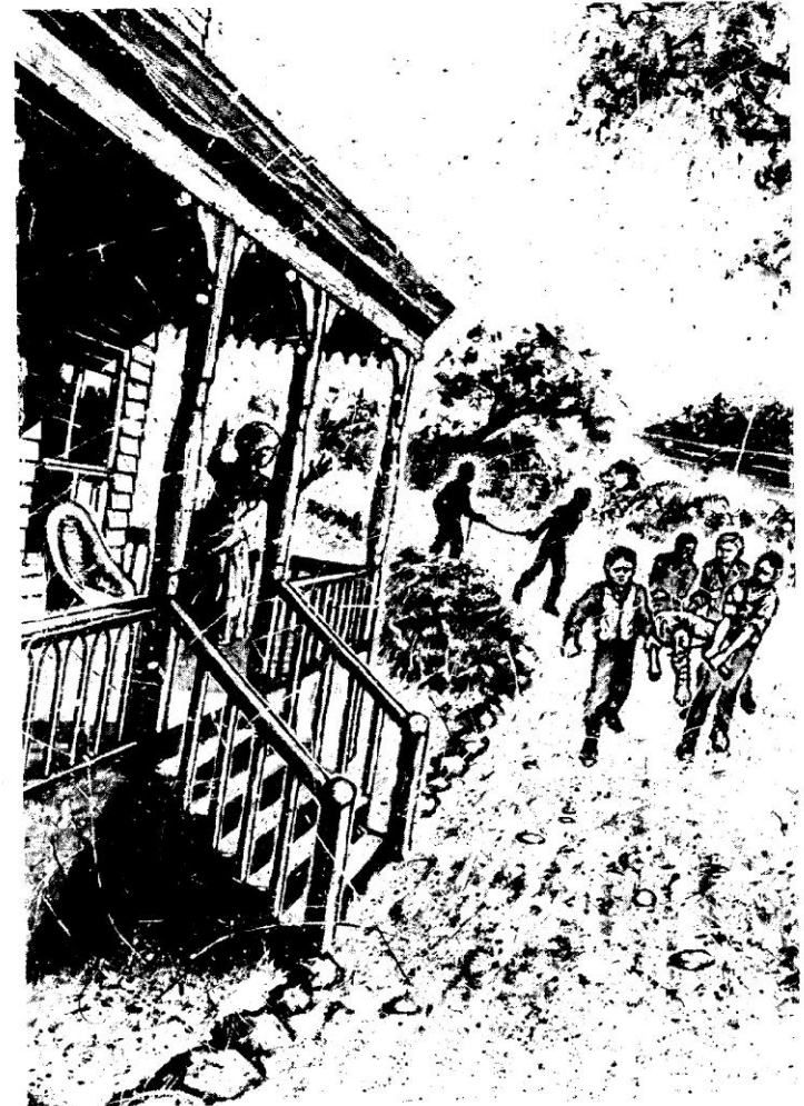
They carried Tom home to the Phelps' house – and they brought Jim too.

When Tom woke up the next day, he felt better. I was in the room and he said to me, 'Jim's all right, isn't he?'