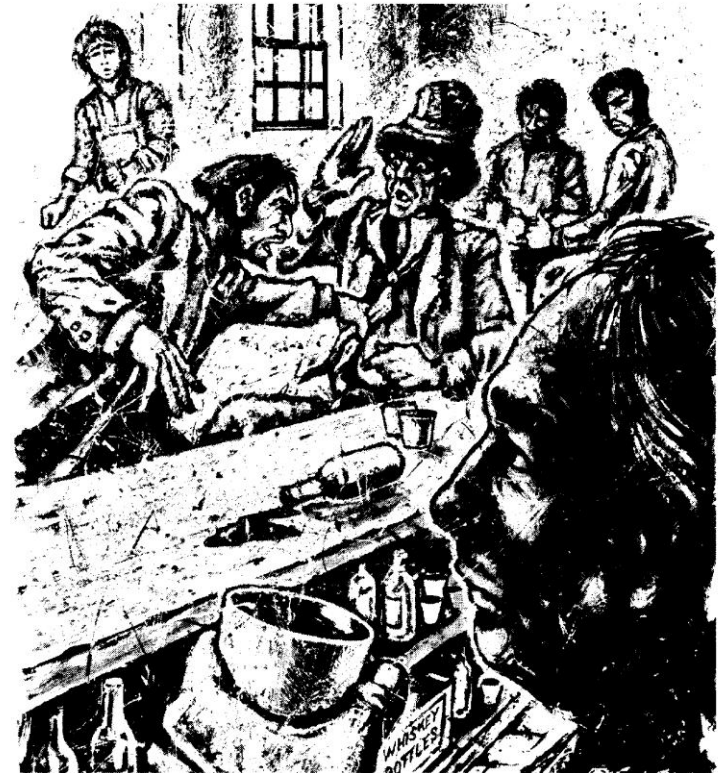
We found the King in a bar, drunk.

'Now we can get away from them,' I thought. I turned