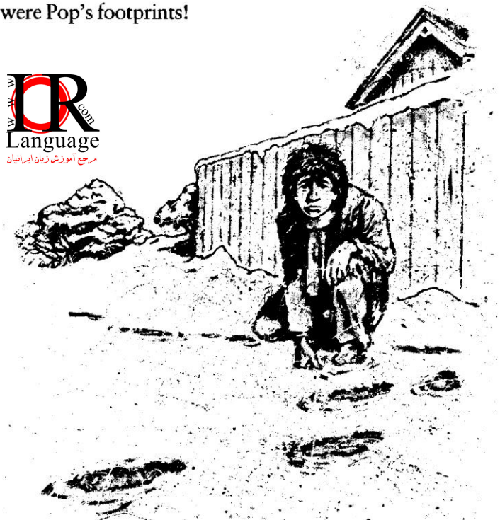
They were Pop's footprints!

A minute later, I was running down the hill to Judge Thatcher's house. When he opened the door, I cried, 'Sir, I want you to take all my money. I want to give it to you.'