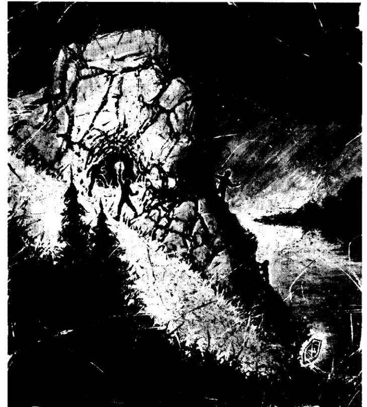
Tom's secret place was a cave, deep in the side of a hill.

'Now, we'll have this gang of robbers,' he said, 'and we'll call it Tom Sawyer's Gang. If somebody hurts one of us, the others will kill him and his family. And if a boy from the