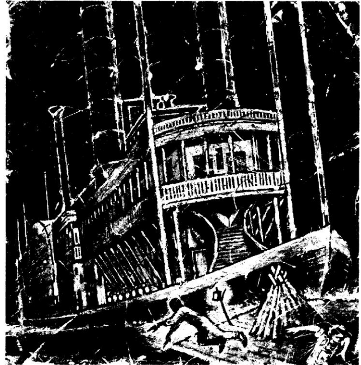
The next minute the steamboat was right over us.

Well, the people who lived in that house were very kind, and they took me in and gave me some new clothes and a