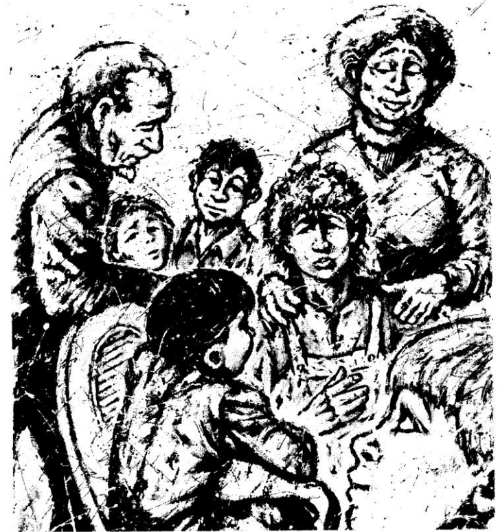
We all sat there talking and I could answer all their questions.

We all sat there talking and I could answer all their questions about the Sawyer family. I was feeling really