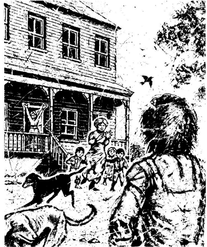
She was smiling all over her face.

I didn't stop to think. 'Yes, ma'am,' I said.