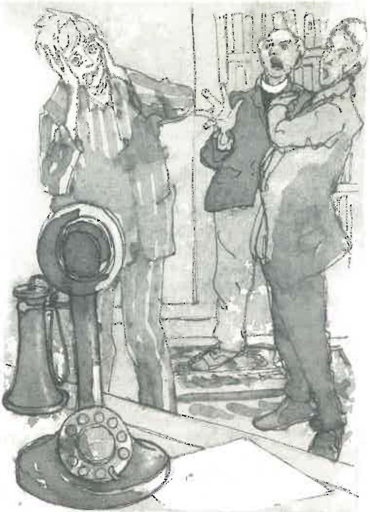
The mouth was open; the dead eyes stared.